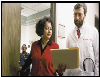
PCP Name and Photo

You are the most important person on the team! You will get the best care if you participate actively with your primary care physician (PCP) and your care manager (CM). Tell them what is working for you and what is not working for you. Work with your team to track your progress using a simple checklist. Let them know if you have questions or concerns about your care. If you take medication, know what it is and take it as prescribed.