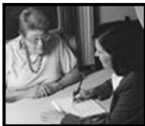
CM Name and Photo Telephone (xxx) xxx-xxxx Email janed@email.rog

He or she will work closely with the other members of the care team to make sure you get the best care possible. The PCP will make and / or confirm your diagnosis and may write or refill prescriptions for medications. The PCP works closely with your care manager to stay informed about your treatment progress. The PCP may also consult with the team psychiatrist if there are questions about the best treatments for you.