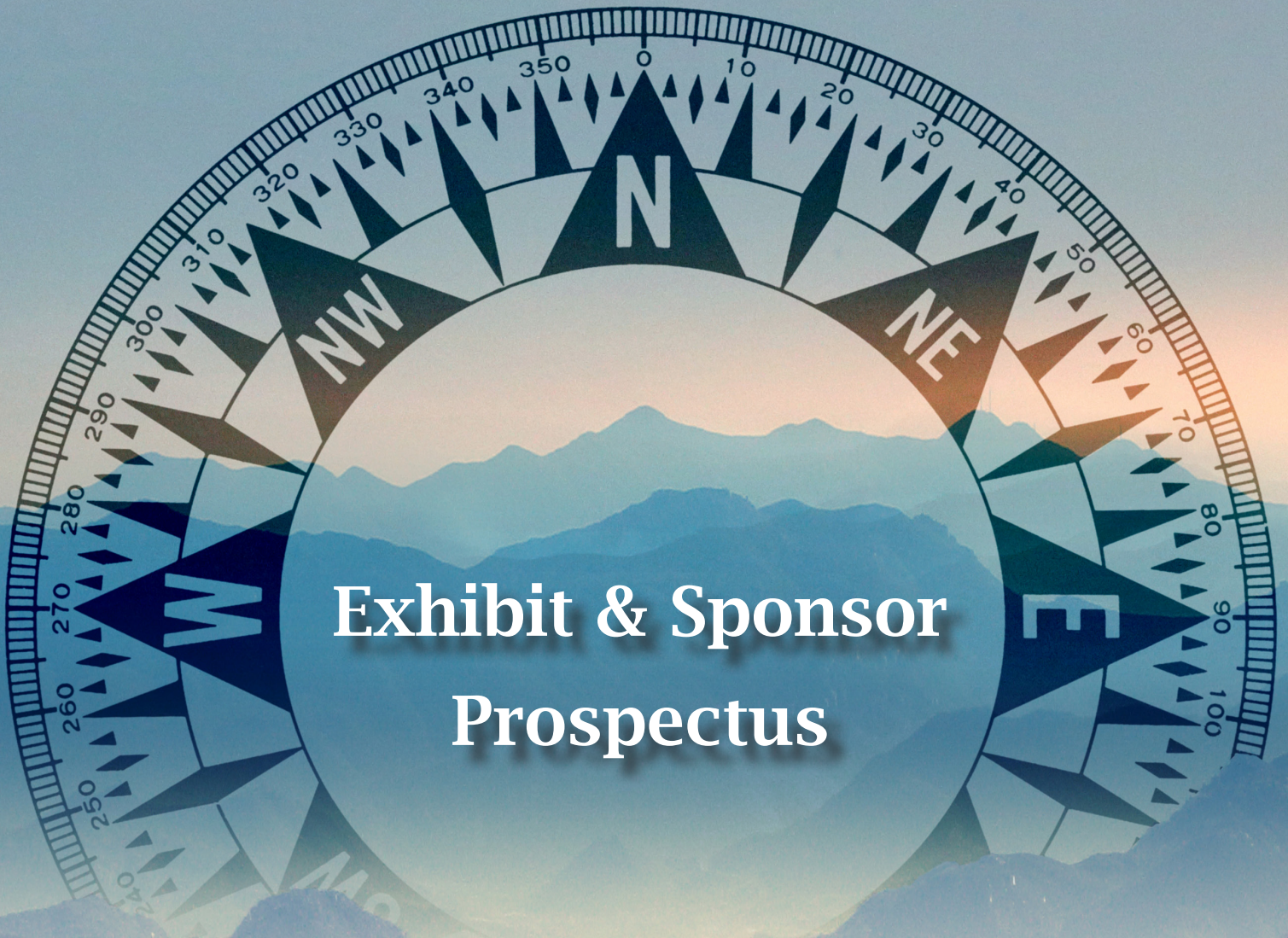
Exhibit & Sponsor Prospectus